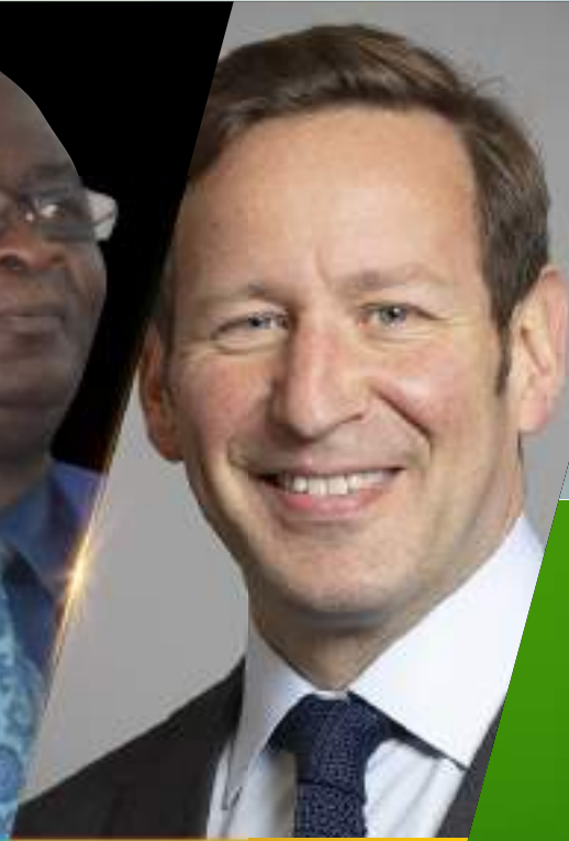
Lord Ed Vaizey

Strategy/IT Consultant Development Partner